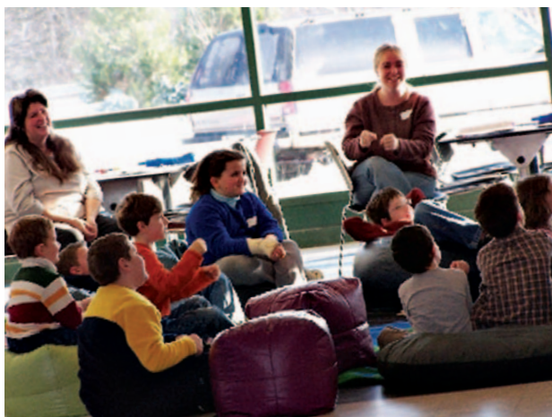
The children's ministry at Moss Brook Community Church in Maine has 20 to 30 kids participating per week.

The church meets in a high school auditorium. Besides the comfortable seating, nice stage and lighting and affordable rent, another advantage is that newcomers are familiar with the high school environment, which helps them feel more comfortable than they might in a traditional church building.