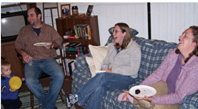
Moss Brook has made small groups a central part of its focus.