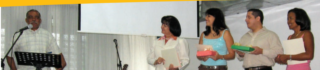
The five graduates of the Ministry Development Center.