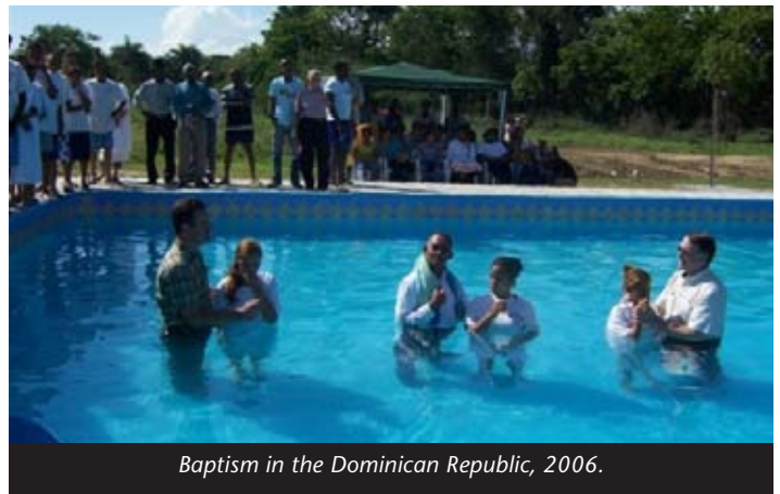
Baptism in the Dominican Republic, 2006.