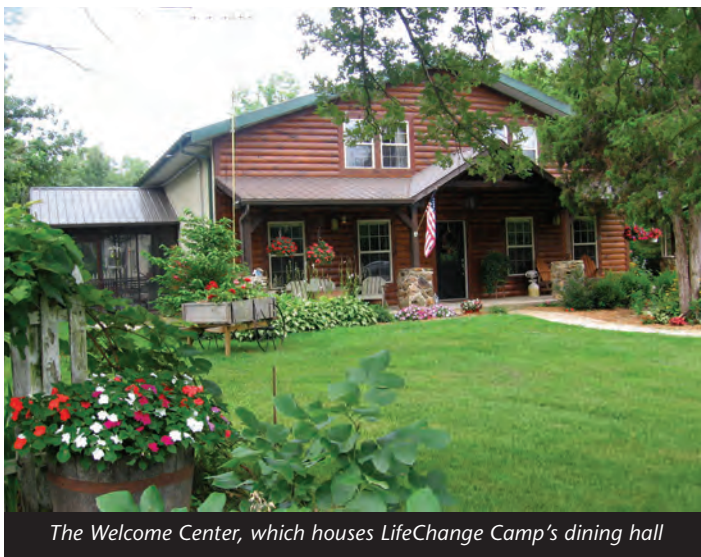
The Welcome Center, which houses LifeChange Camp’s dining hall