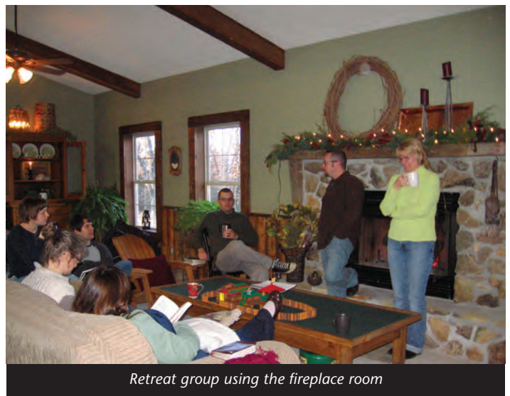
Retreat group using the fireplace room