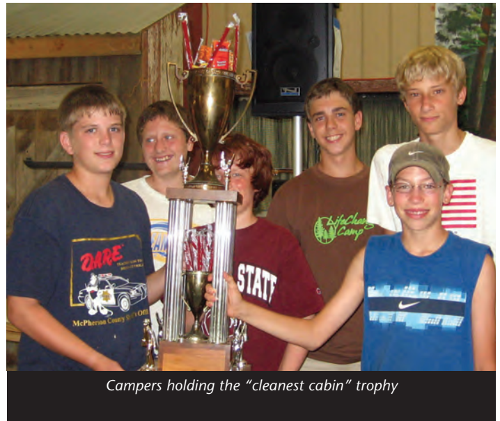
Campers holding the “cleanest cabin” trophy