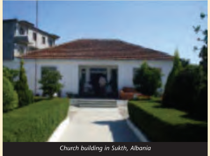
Church building in Sukth, Albania